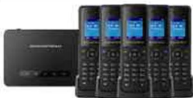
CORDLESS HANDSET – MULTIPLE AT SINGLE SITE